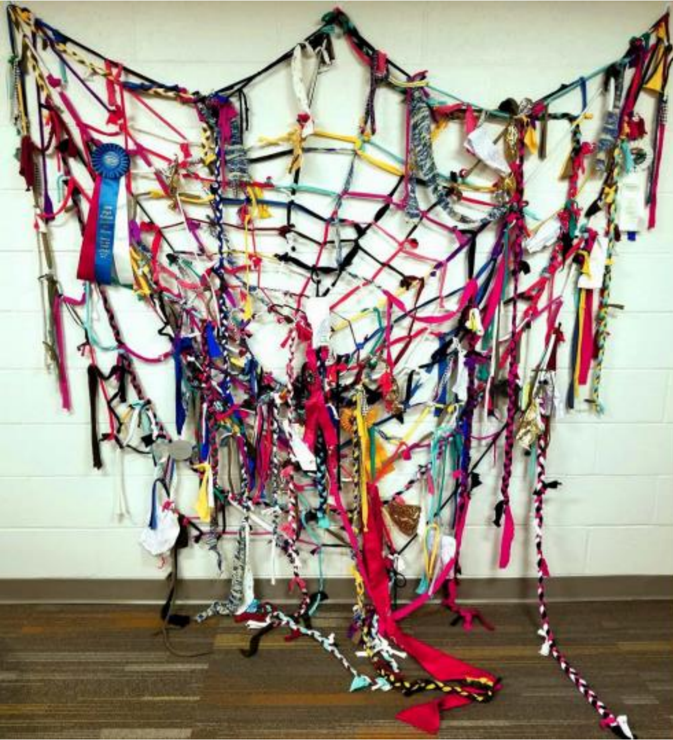
Asia Spinks Burden 2020 old t-shirts, award ribbons, gold balloon pieces, red sash, journal pages 6' x 6' x varied